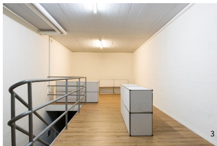
1. 'Zzz...' Installation view, Ecole cantonal d'art Lausanne, 2018